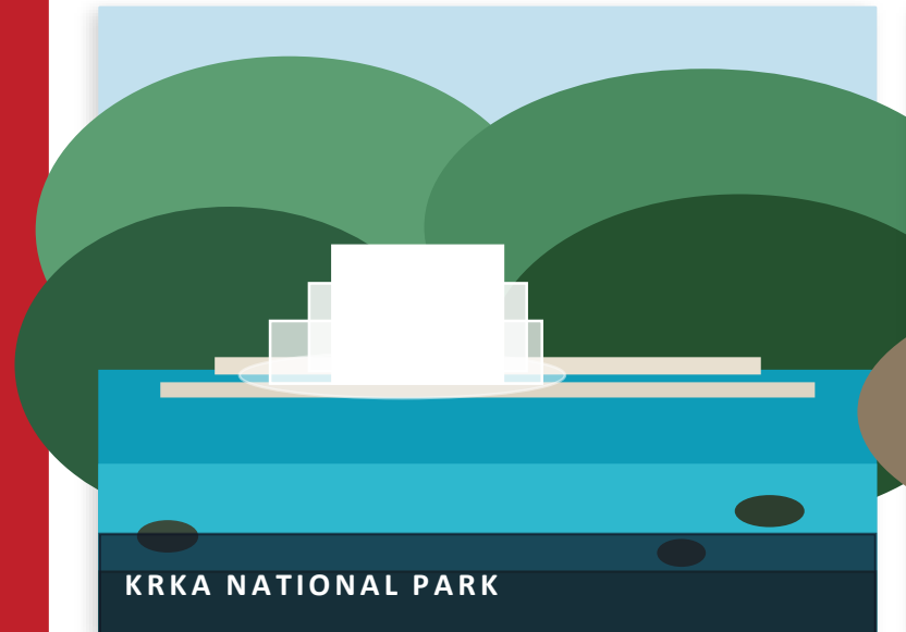
KRKA NATIONAL PARK

Wednesday, 27 May 2026 — Full Day Field Trip